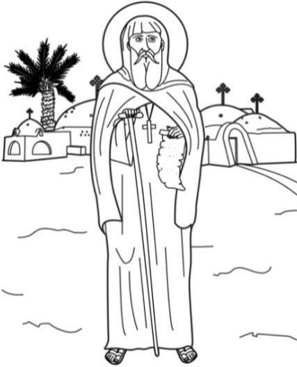
St. Anthony the Great

I can become more like Jesus through prayer, fasting and almsgiving.