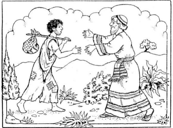
The Prodigal Son