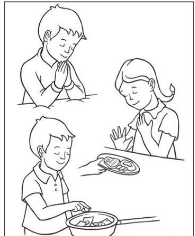
Three Pillars of Faith